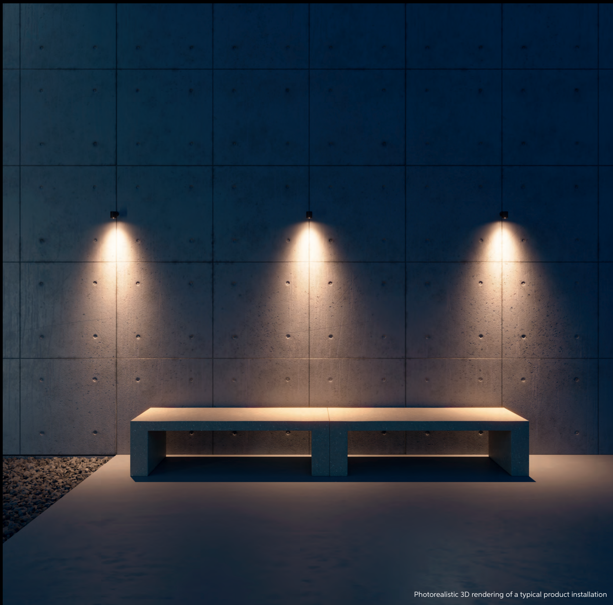
Photorealistic 3D rendering of a typical product installation